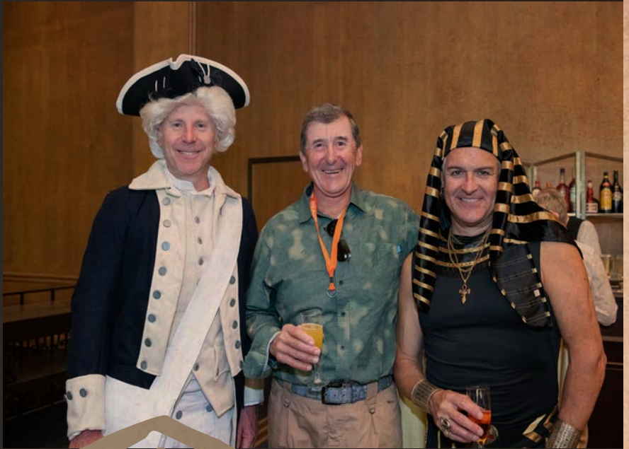
Table themes included things like Easter Island, George Washington, the Old West, a Wine Safari, Field Trip, Security Guards, Ancient Egypt, Movie Night, and Ancient Sicily.

The 39th Annual CWL event raised over $588,000 for the Seattle Police Foundation!